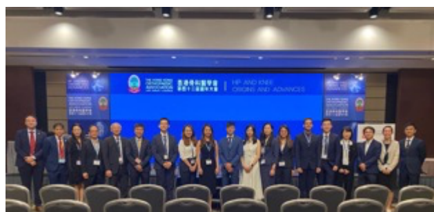
Presenters and moderators of the hand and microsurgery free paper session.